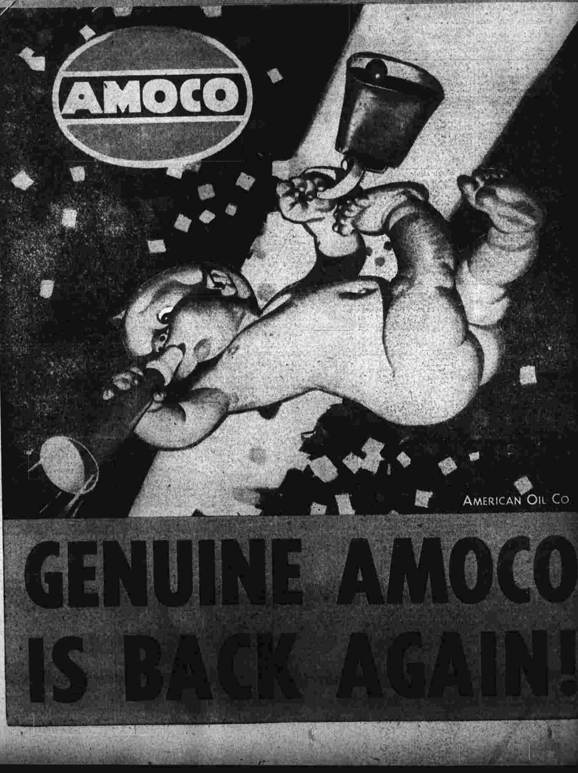
AMERICAN OIL CO.