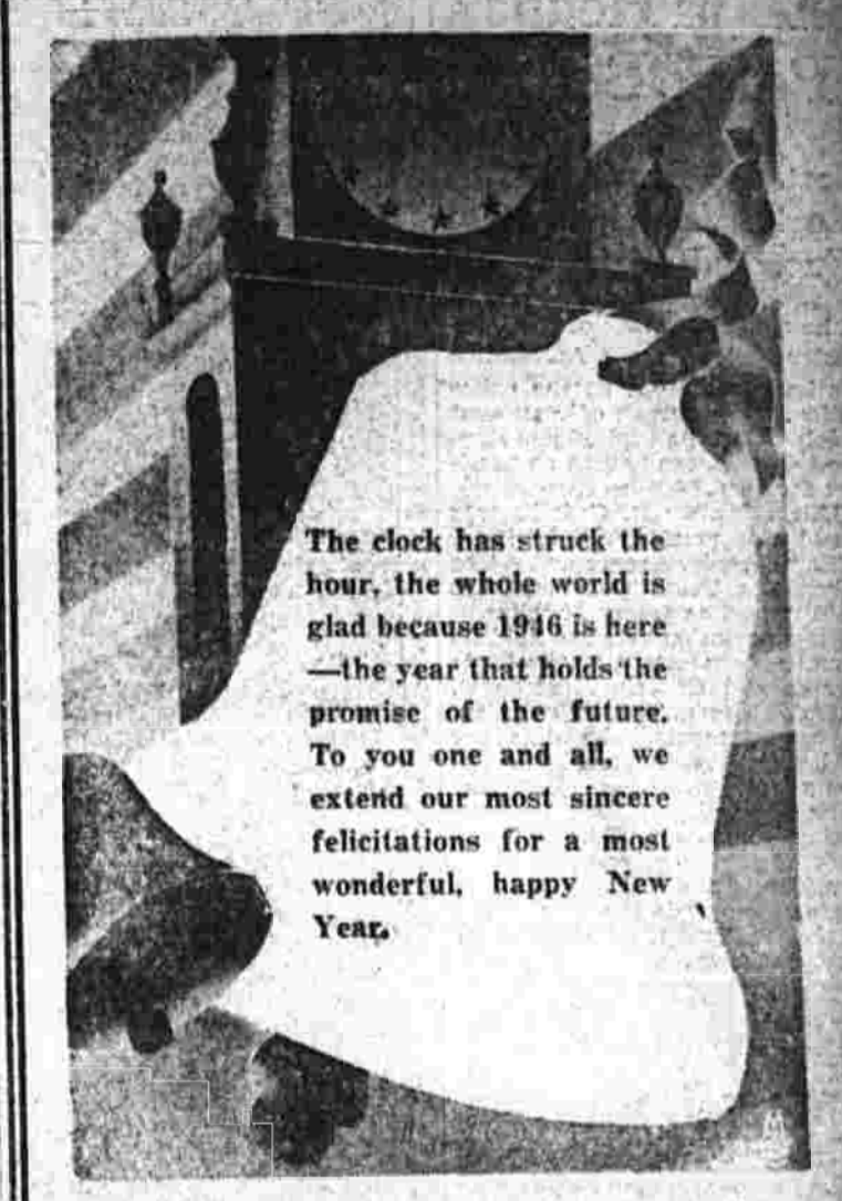
The clock has struck the hour, the whole world is glad because 1946 is here...

Modern Way Relieves Miseries of Colds Fluently—During Night